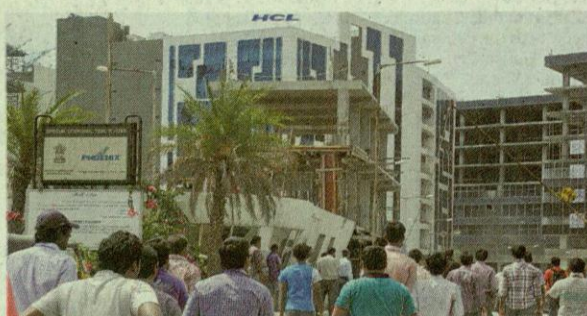
Why gravitate only towards IT? — P. V. Sivakumar

To fill up the vacant seats in private engineering colleges, the cut-off score for students seeking admission is being considerably watered-down. Added to this, many private colleges lack the intellectual infrastructure — comprising libraries, broadband con-